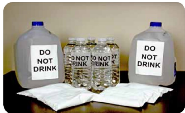
Stabilize temperature in a refrigerator with water bottles labeled “Do NOT Drink.” Stabilize temperature in a freezer with frozen coolant packs.

More information can be found on the CDC website .