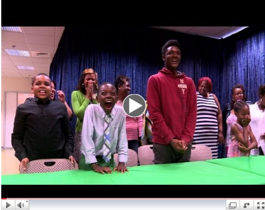
Raw Video: The President Talks With Young Asthma Patients

-A recent report found that mothers who are obese or overweight during pregnancy are more likely to have children with asthma. The review looked at 100,000 mother-child pairs and found that the risk of a child having asthma was 36% higher if the mother was obese during pregnancy. The authors noted that this influence on childhood asthma appears to be even stronger than status of asthma in the mother.