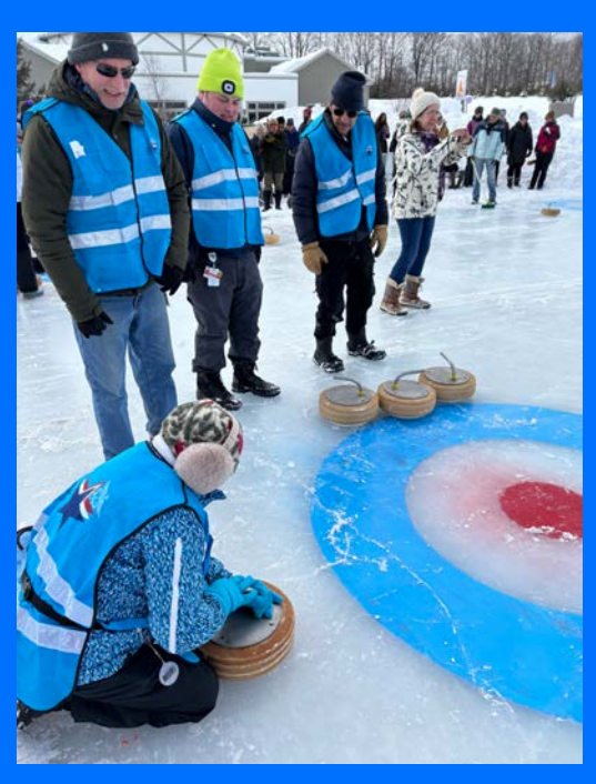
LVMRC and NEKMRC field a competitive team at Curds and Curling.