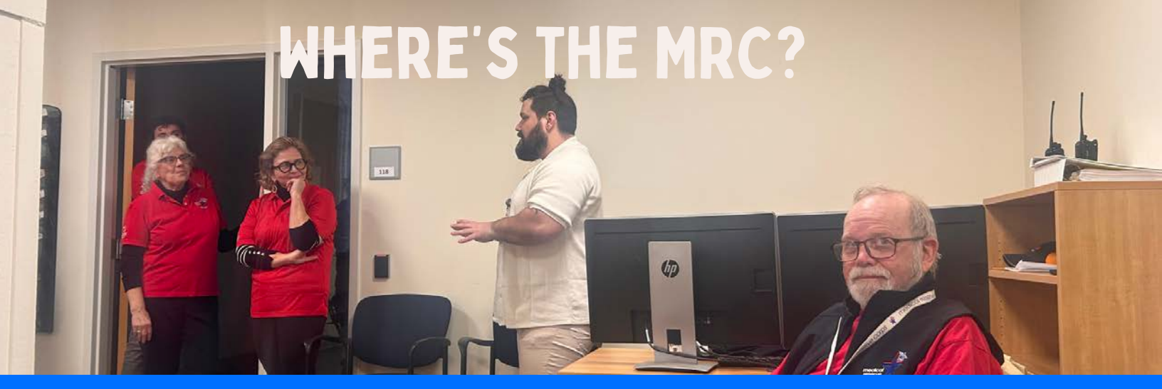
MRC volunteers from around the state participate in the filming of our first ever MRC recruitment video the week of February 5th.