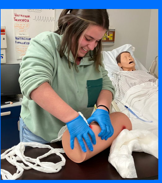
A Castleton University student demonstrates wound packing at a class taught by RAMRC.