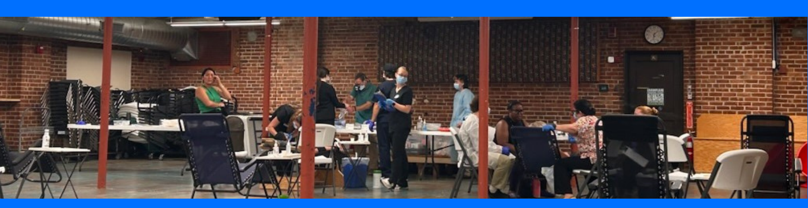
MRC volunteers assist VDH Burlington District Office at a pop-up dental clinic.